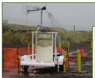
Recovery of petroleum products from groundwater at the former Adak Naval Complex in Alaska, for example, was powered by a mobile wind turbine.

Details on benefits, costs, and other factors that can help project managers select and implement the most suitable methods to reduce transportation-related footprints are provided in EPA's Green Remediation Best Management Practices: Clean Fuel & Emission Technologies for Site Cleanup . 5b