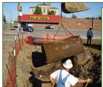
Surgical excavation and tank removal at the G&L Clothing site in Illinois allowed for minimal site disturbance and maximum recycling or reuse of excavated materials.