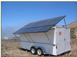
Electricity for various needs can be generated onsite by mobile systems that capture renewable energy.

Other methods to reduce liquid fuel consumption and air emissions during UST site cleanup involve increased substitution of petroleum fuel with sources of renewable energy, particularly for powering remediation components or auxiliary equipment with a low energy demand. A small off-grid wind turbine and/or or photovoltaic (PV) system, for example, can be equipped with deep-cycle batteries to provide relatively steady power.