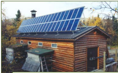
An off-grid PV system at Brooks Camp, AK, powered an air sparging pump that operated only during daylight hours, which sufficiently treated contaminated groundwater while avoiding energy loss and freeze potential associated with battery storage.