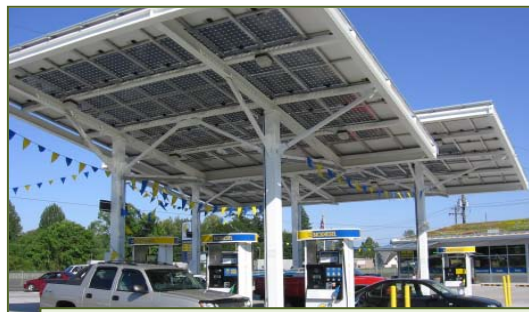
Sustainable redevelopment of a remediated brownfield site formerly used as a gasoline station in Eugene, OR, focused on building a biofuel station with solar power along with low impact development elements such as bioswales; the biofuel is made of discarded cooking oil collected across the state.

Another example is the Smart Growth Network, which identifies principles that can minimize air and water pollution and preserve natural lands during property development. 18 Implementation of the principles at UST sites can help integrate a greener cleanup into site reuse. As a member of the network, EPA offers technical assistance and funding to organizations and communities working toward smart growth and sustainable communities.