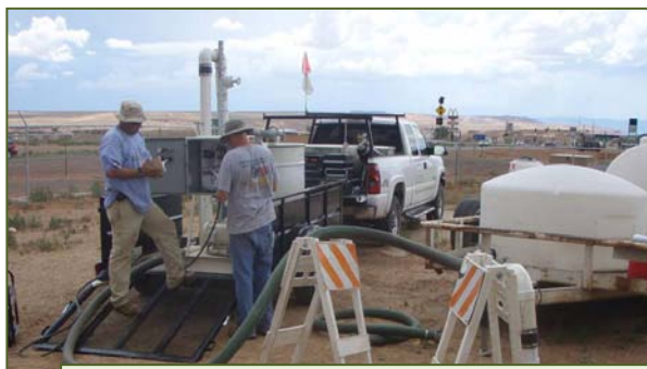
EPA Region 9 investigation of LUST-contaminated soil and groundwater affecting Navajo Nation and Hopi Tribe tribal lands near Tuba City, AZ, involved use of a conceptual site model and mobile laboratory to guide subsurface application of food-grade vegetable oil that accelerated bioremediation of contaminated soil.

BMPs regarding onsite and offsite transportation can help reduce the environmental footprint of UST system removals and follow-on site remediation. Opportunities to reduce air pollutant emission from internal combustion engines in vehicles and stationary sources involve identifying local service providers who maximize use of: