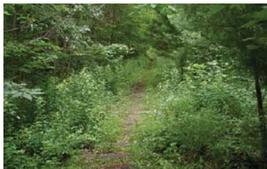
Image of the old rail line that the Department of Transportation will be adding to the bike path.

The site consists of several properties with asbestos-containing soils including the former W.R. Grace facility and its adjacent properties. Beginning on September 27, 2010, W.R. Grace will begin removing the asbestos fibers located inside the building and in the surface and subsurface soils. W.R. Grace will place and cover the asbestos-containing soil on the Oldon property. EPA and MassDEP will oversee the work on this project.