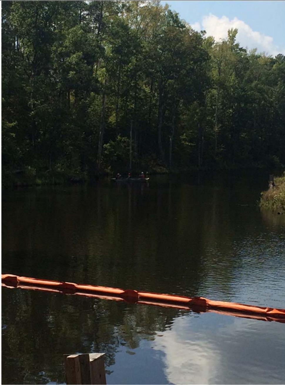
Diver in Pond #3 locating the underwater culvert.