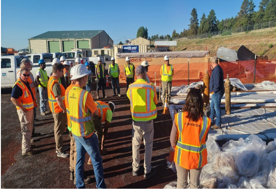
Picture 1: Cylinder handling and safety training at the ICP-Staging Pad.