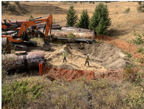
Laying of sawdust in solidification pit