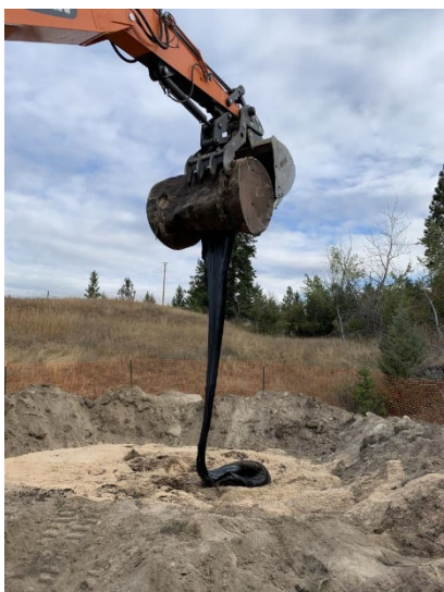
Draining of tank #1