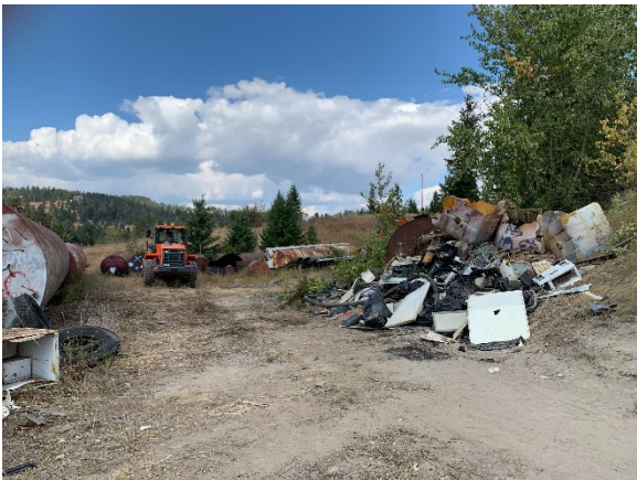
Consolidated white goods and debris