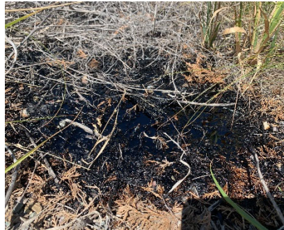
Hydrocarbon Waste Product