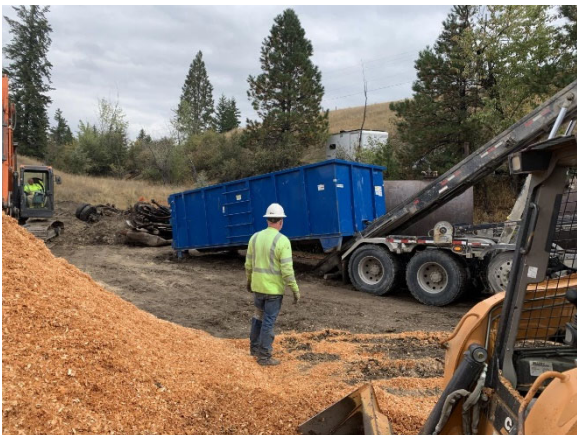
Removal of first roll-off carrying solidified waste