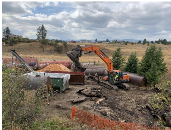
Loading of first roll-off for metal recycling