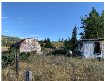
Southeast Side of Site

In July 2022 the U.S. Environmental Protection Agency (EPA) requested access to inspect and conduct cleanup activities on-site. However, this request was denied by the property owner. As a result, the EPA, via the Department of Justice (DOJ), sought a Warrant for Access through the Federal District Court for the District of Montana. The Court issued the requested warrant on September 7, 2022 and EPA mobilized to the Site on September 15, 2022. The warrant expires on November 30, 2022.