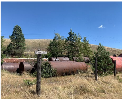
Northeast Side of Site